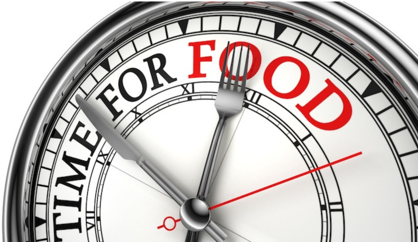
Youth Soccer News – What is the correct TIME FOR FOOD? Nutrition information for soccer players

By doing so, you ensure that you are taking in the appropriate amounts of nutrients to fuel your activity. Remember to choose whole foods that nourish the body and work synergistically for you.